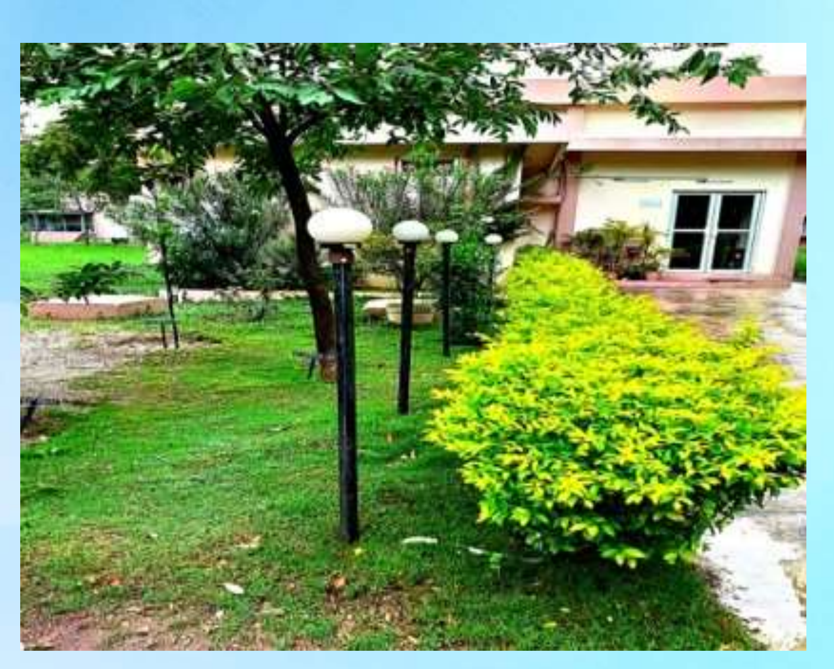
Solar Light Switching