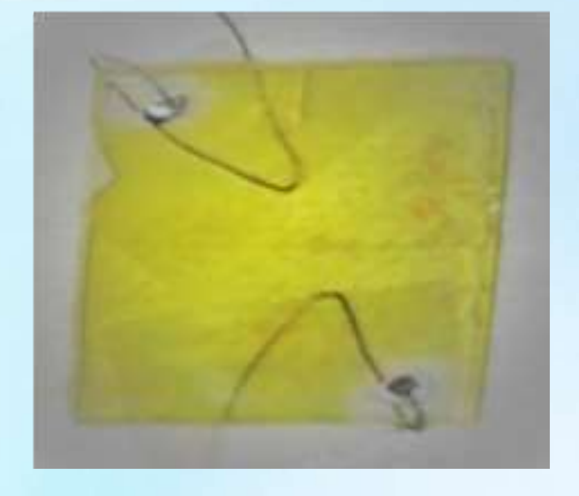
Thin Film LDR (TFLDR)