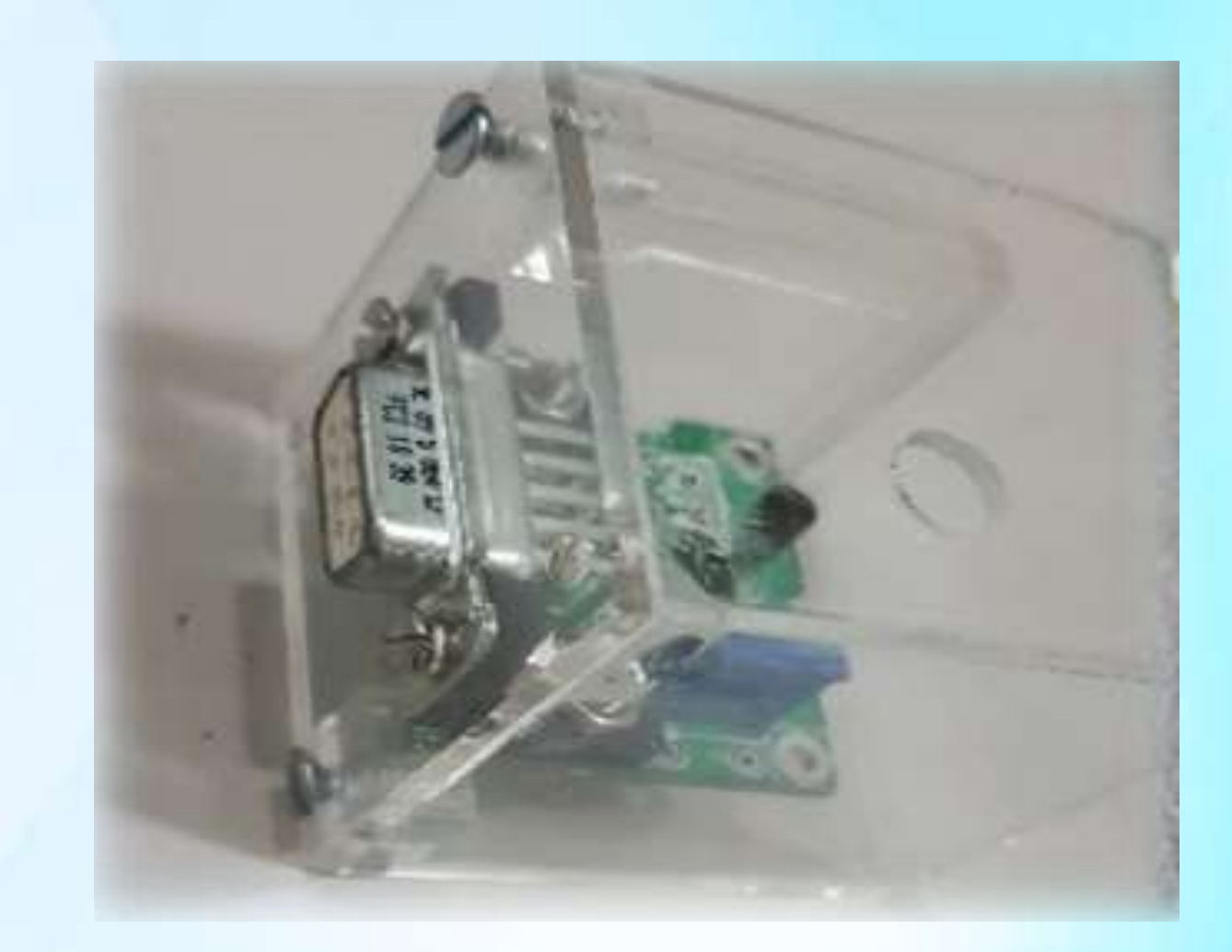
Plastic Module with TFLDR